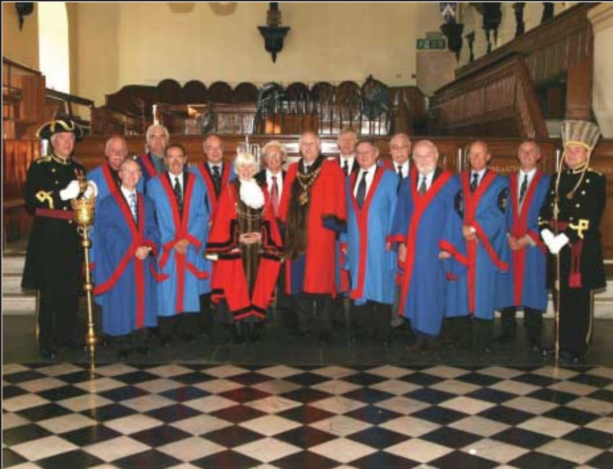
City Mace Bearer