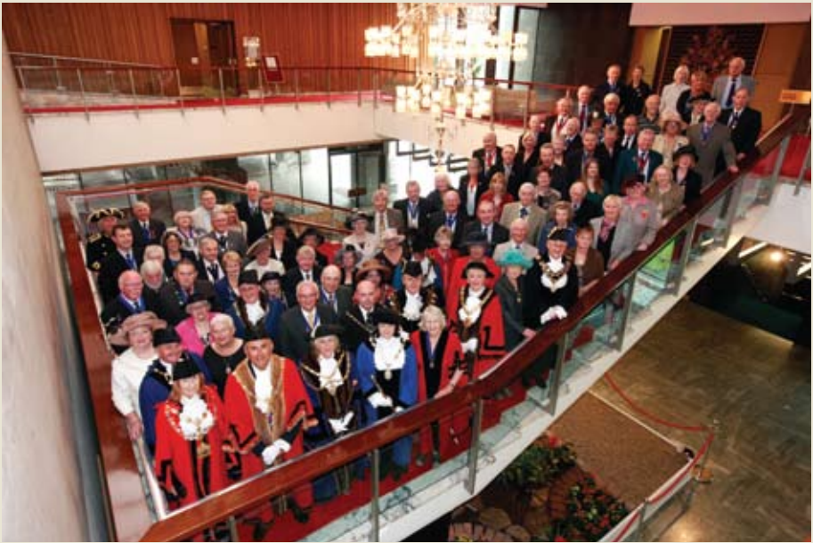
Sheriffs congregate for their Annual Meeting at the Civic Centre.