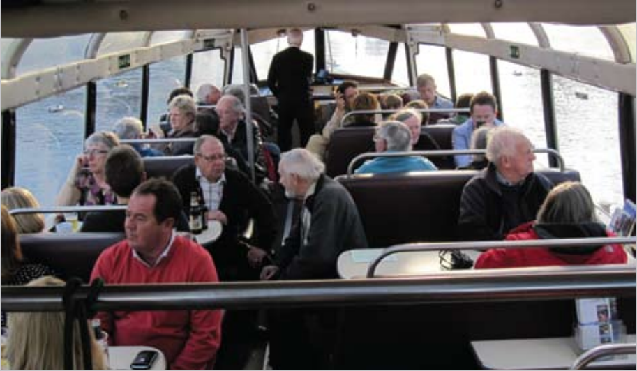
Shipwrights Boat trip on the River Tyne