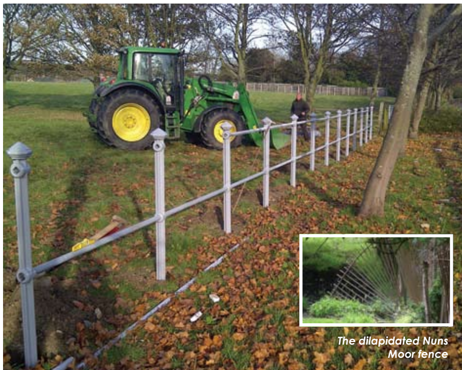
The dilapidated Nuns Moor fence

Herdsmen member Billy Harland assists with site reinstatement following fence installation on Hunters Moor.